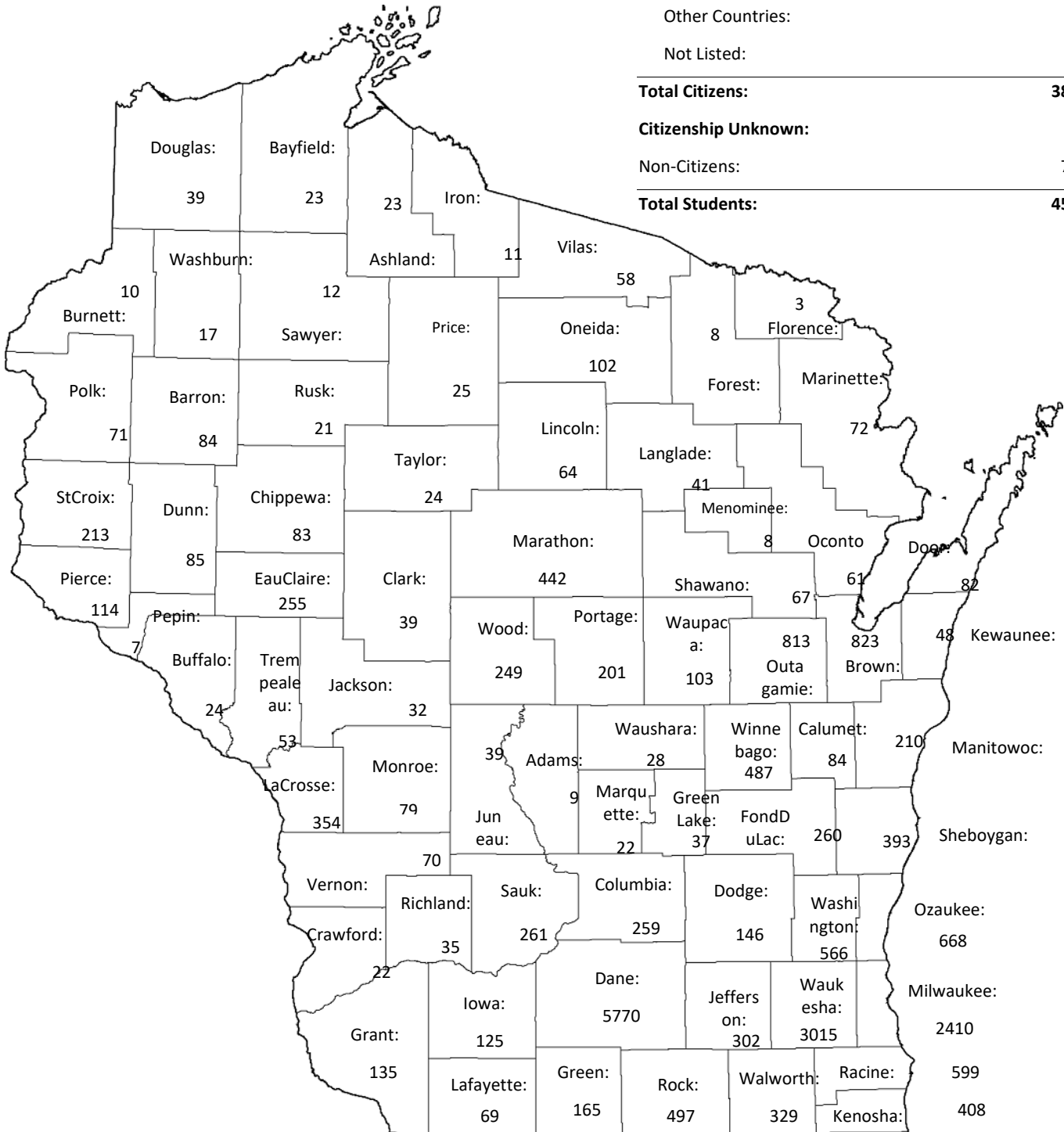
Home Address by Wisconsin County at Time of First Admission (U.S. Citizens) Fall 2019-2020 (As of the End of the Sixth Week of Instruction)