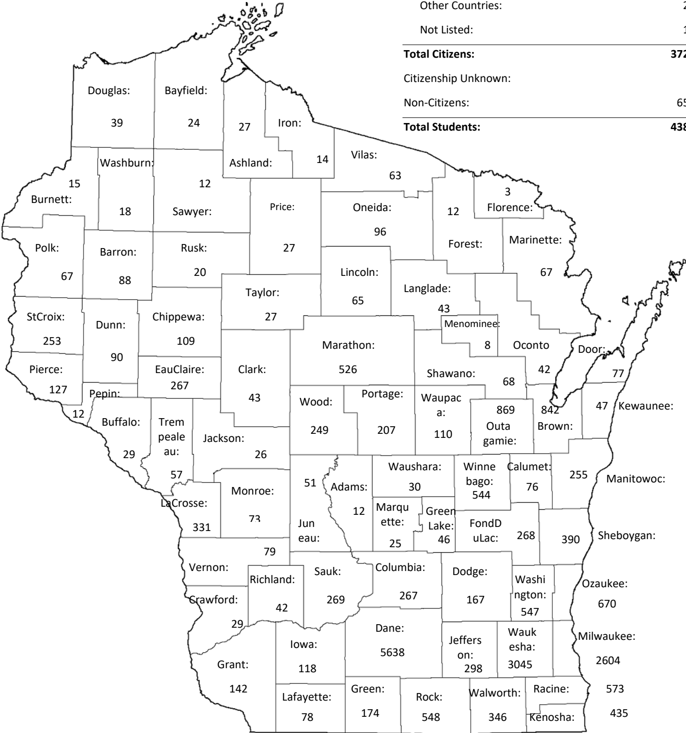
Home Address by Wisconsin County at Time of First Admission (U.S. Citizens) Fall 2017-2018 (As of the End of the Sixth Week of Instruction)