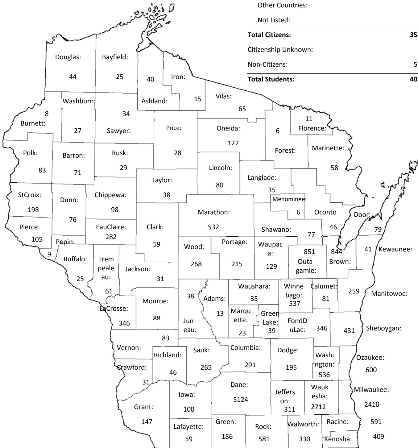
Home Address by Wisconsin County at Time of First Admission (U.S. Citizens) Spring 2013-2014 (As of the End of the Sixth Week of Instruction)