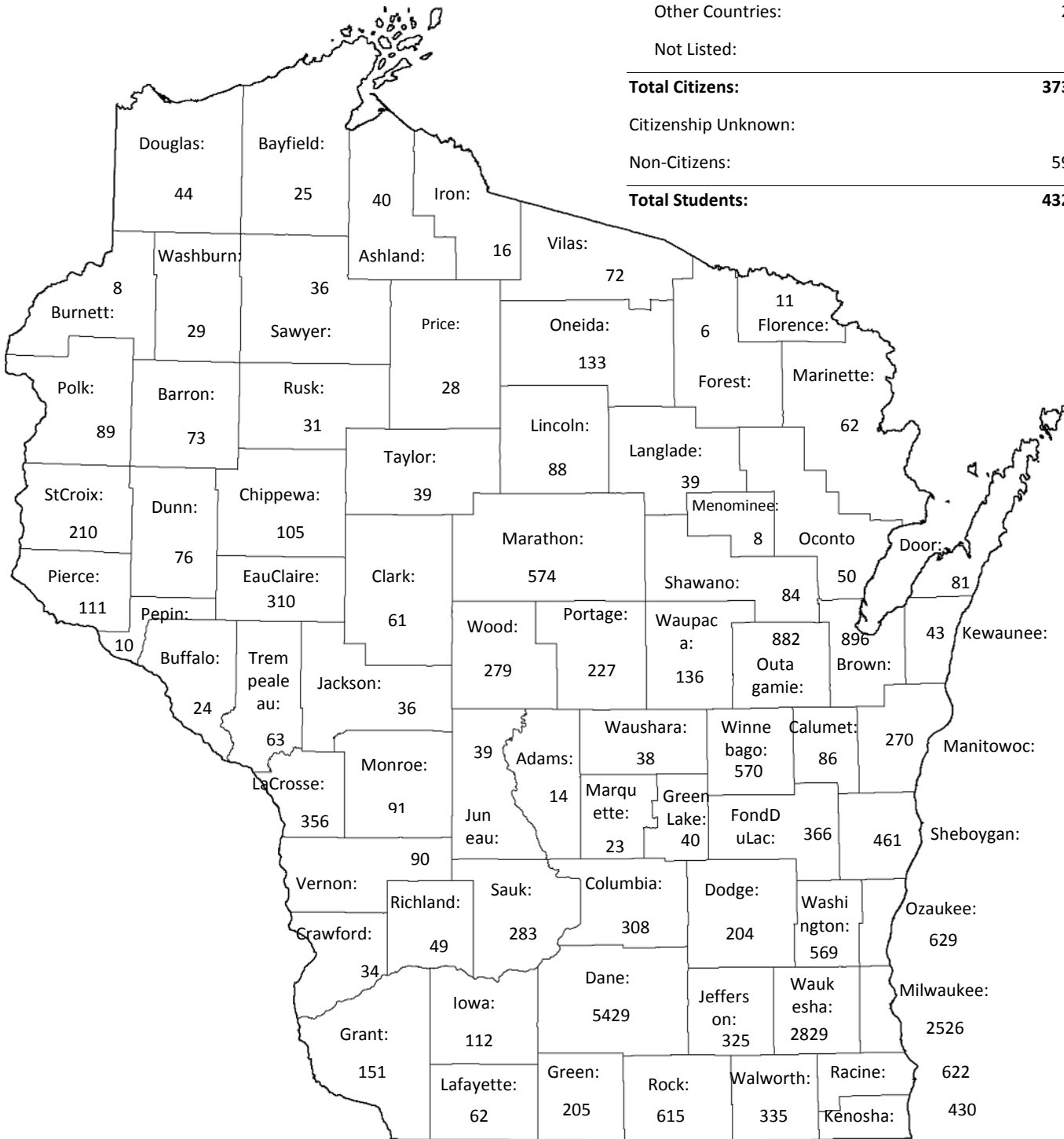
Home Address by Wisconsin County at Time of First Admission (U.S. Citizens) Fall 2013-2014 (As of the End of the Sixth Week of Instruction)