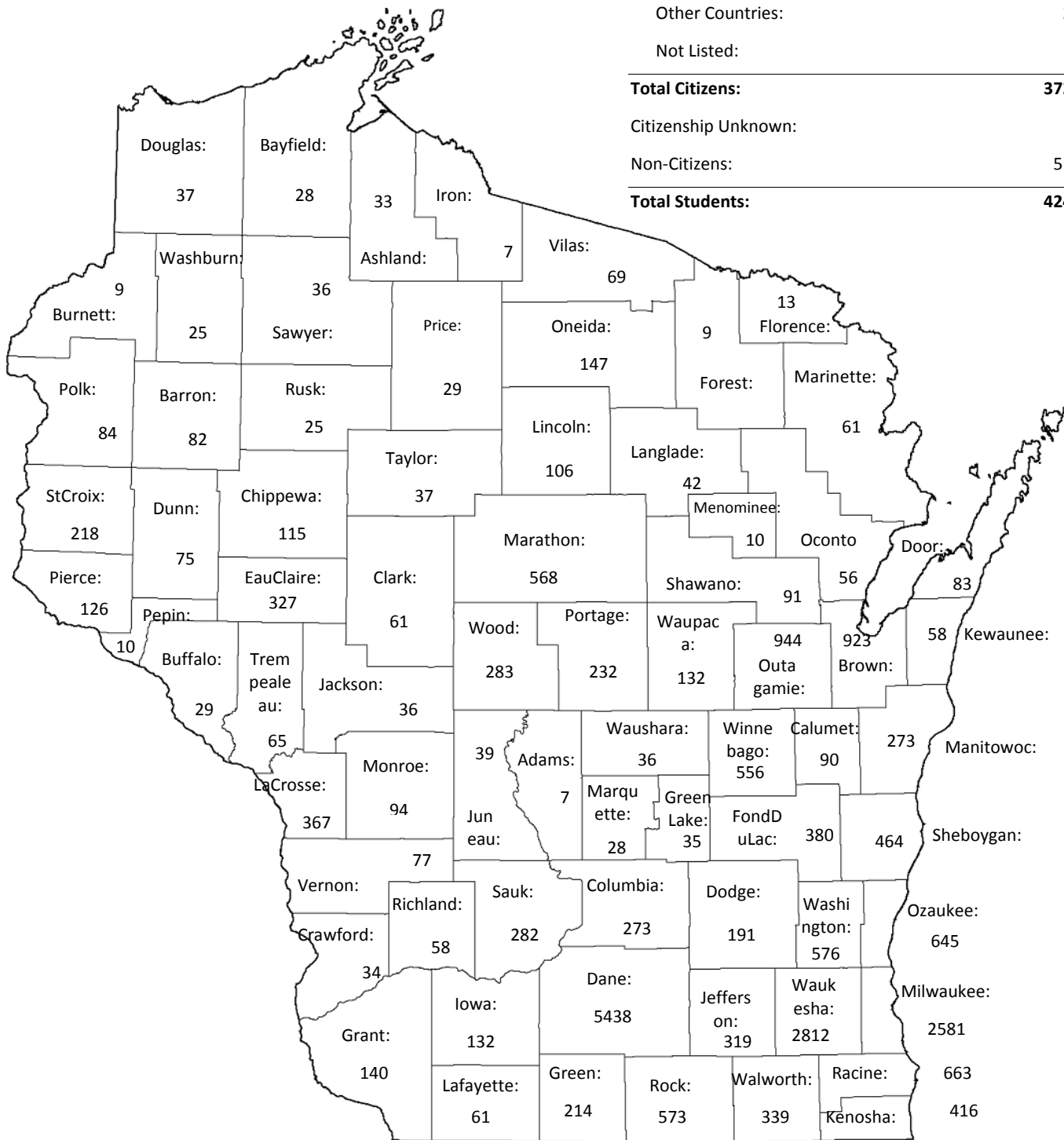
Home Address by Wisconsin County at Time of First Admission (U.S. Citizens) Fall 2011-2012 (As of the End of the Sixth Week of Instruction)