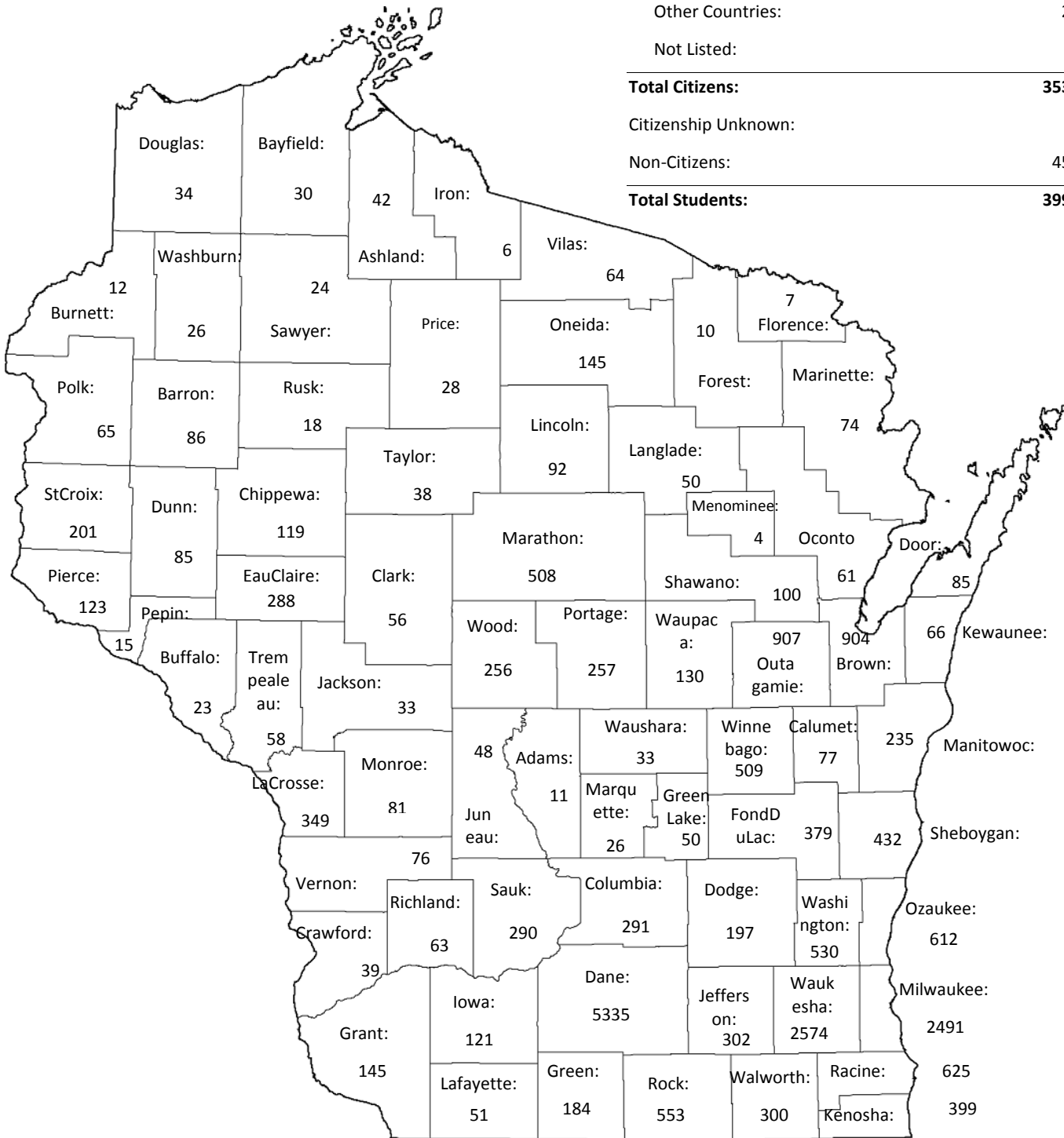
Home Address by Wisconsin County at Time of First Admission (U.S. Citizens) Spring 2009-2010 (As of the End of the Sixth Week of Instruction)