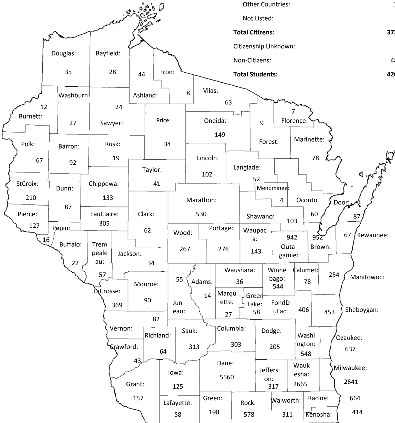
Home Address by Wisconsin County at Time of First Admission (U.S. Citizens) Fall 2009-2010 (As of the End of the Sixth Week of Instruction)