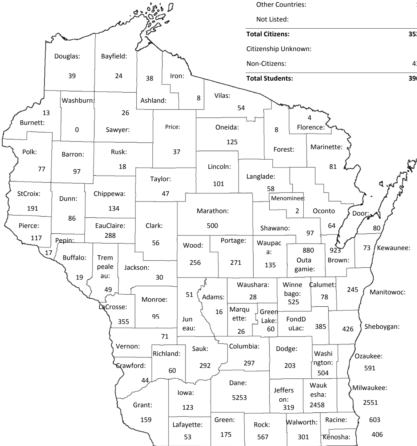
Home Address by Wisconsin County at Time of First Admission (U.S. Citizens) Spring 2008-2009 (As of the End of the 10th day of Instruction)