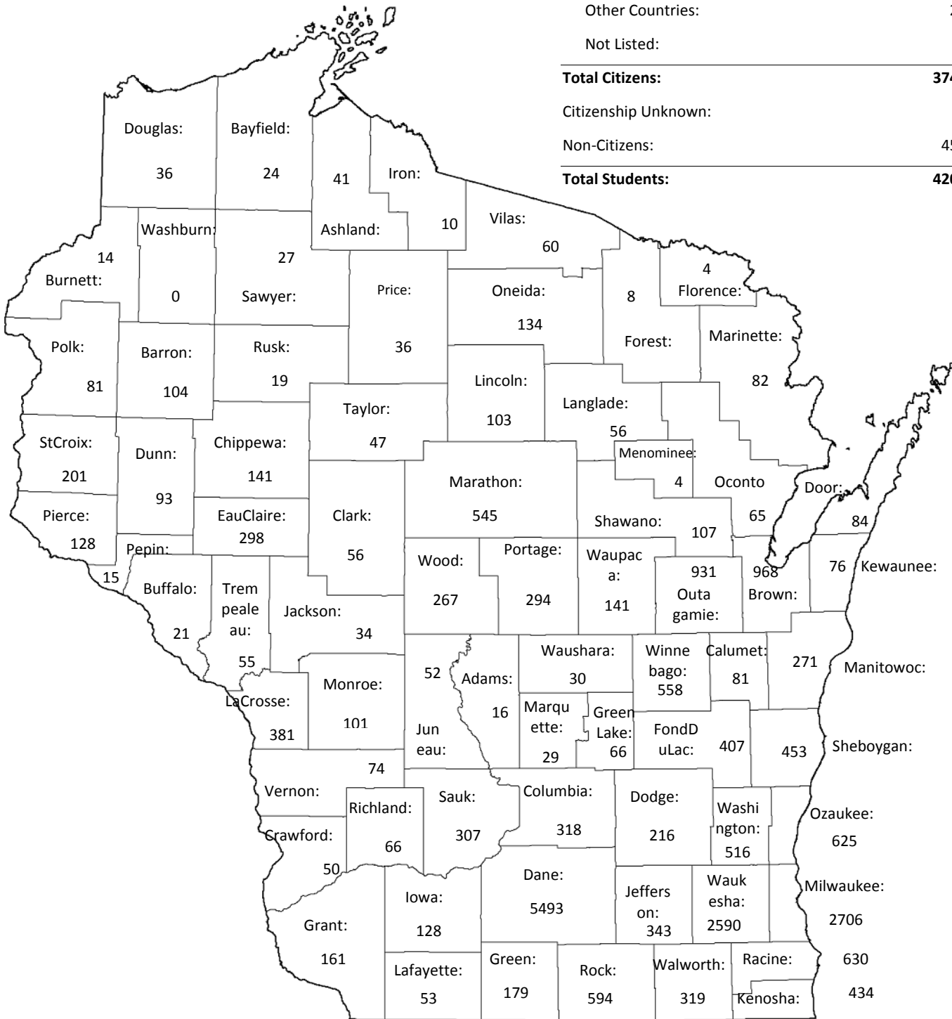
Home Address by Wisconsin County at Time of First Admission (U.S. Citizens) Fall 2008-2009 (As of the End of the Sixth Week of Instruction)